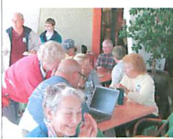
Havin' FUN on the patio