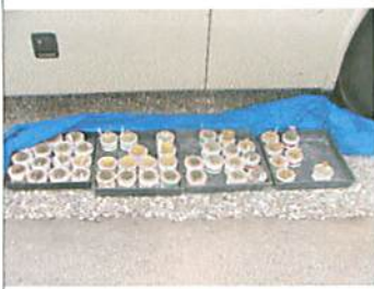
Souvenir Cactus plants