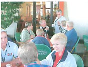
Old Pueblo Rally III Photos